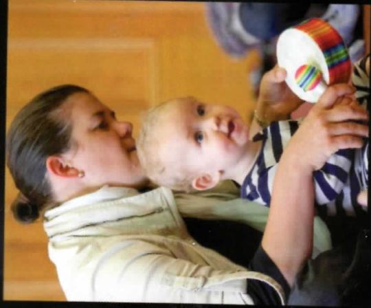
music feeds souls