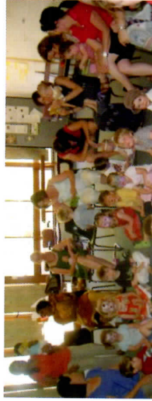
A local playgroup celebrating Christmas.